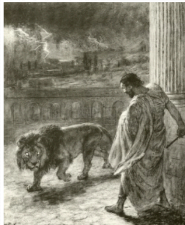
A lion spotted at the Capitol