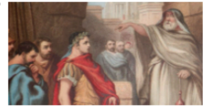
Pictured here is the soothsayer approaching Julius Caesar warning him of what is about to come on the ides of March.